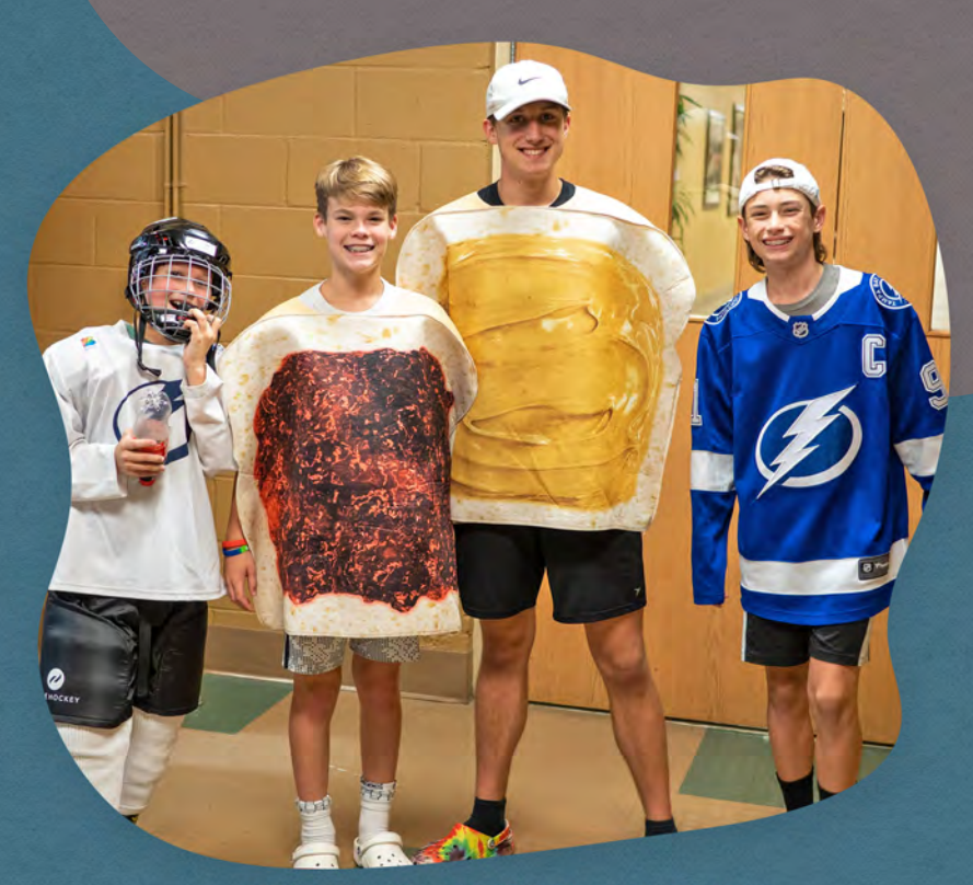
Calvary Youth Costume Party October 2022

Here at Calvary Chapel, we are intentional about providing people with opportunities to meet with one another to worship, fellowship and most importantly study God's word together. Our monthly Wednesday Night Community dinner events create a comfortable place for the entire church body to fellowship before the mid-week service and youth group service.