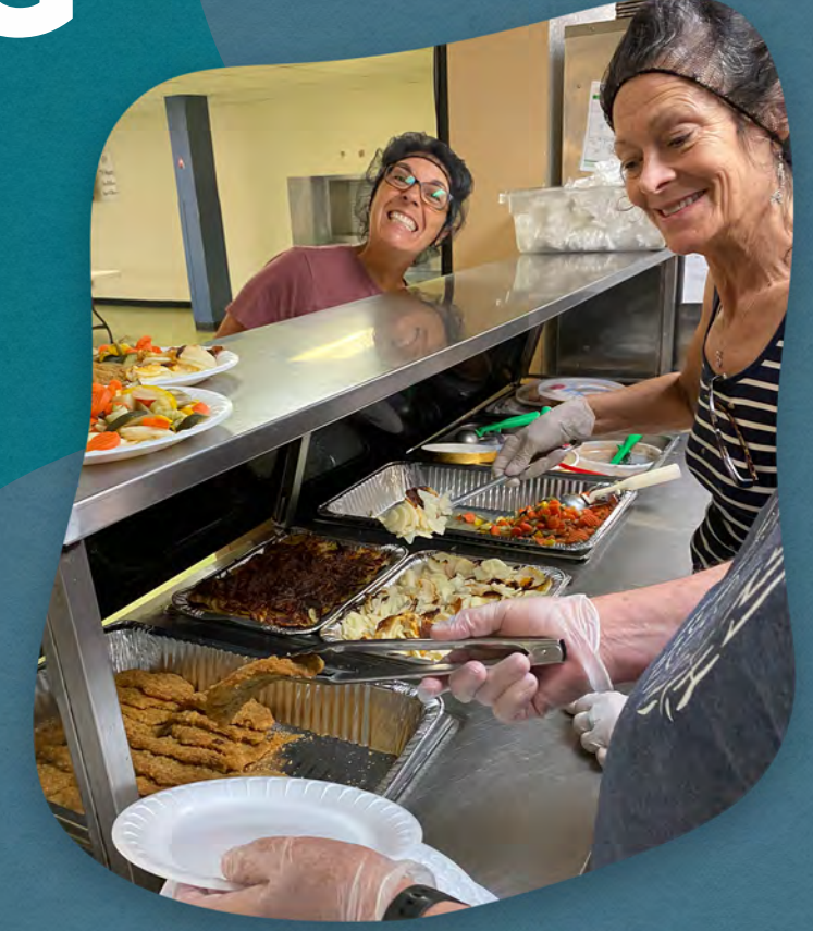
Downtown Homeless Outreach August 2022

Our ministry takes place both within our church and with the community around us. As we generously serve in our local community and share the love of God through practical acts of kindness, we develop more compassion and a deeper understanding of God's love for us. Simple acts of selfless love can open hearts to Jesus, and together we can make a difference!