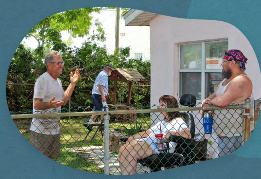
Men of Arms Yard Clean-Up January 2022

In 2022, Calvary Chapel St. Petersburg ministered to people from 22 different countries through our ESL program, started an ESL Bible Study, and sent three people to Tanzania to help with a Bible training program. We also held a Missions Dinner to encourage our church to think and live missionally, and led local community trainings and events like Baptism classes, a Sharing Your Faith class, and a "Get to Know Us" meeting. Through these ministries, we seek to be a movement of the gospel, spreading God's love and transforming lives.