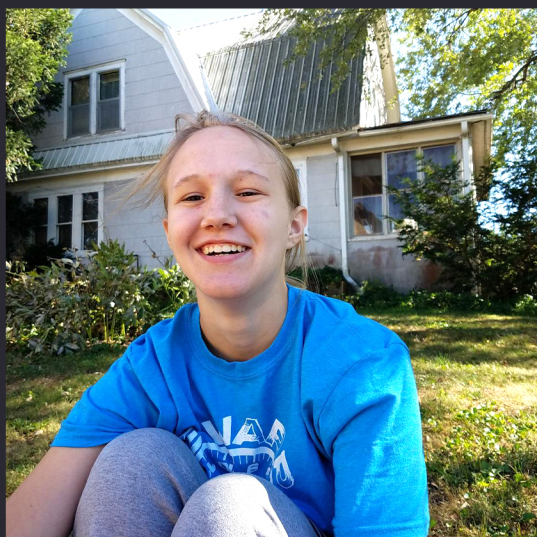
New Believer // Samaritan's Purse Outreach